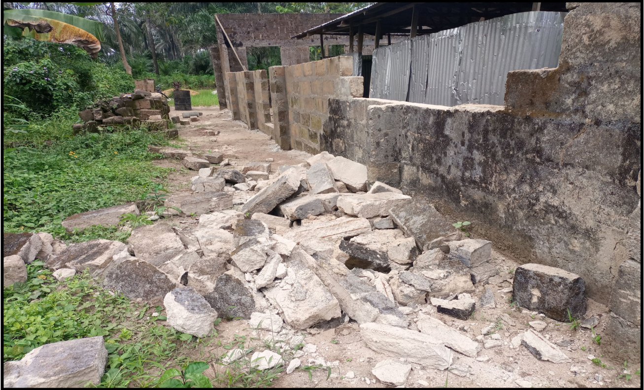
Reconstruction work at the auditorium at Ikot Enang Church. The entire building collapsed during the heavy monsoon rains.